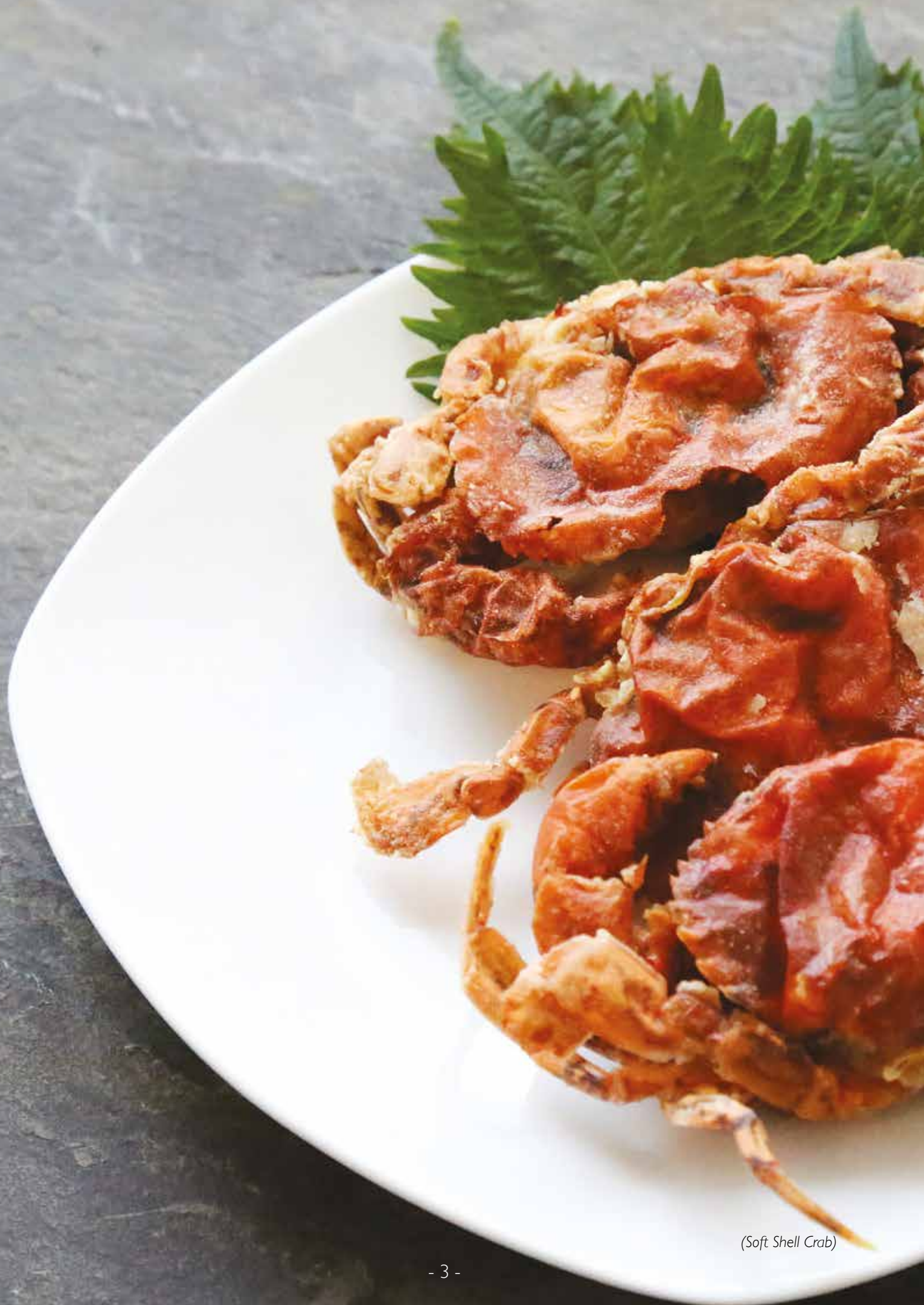
(Soft Shell Crab)