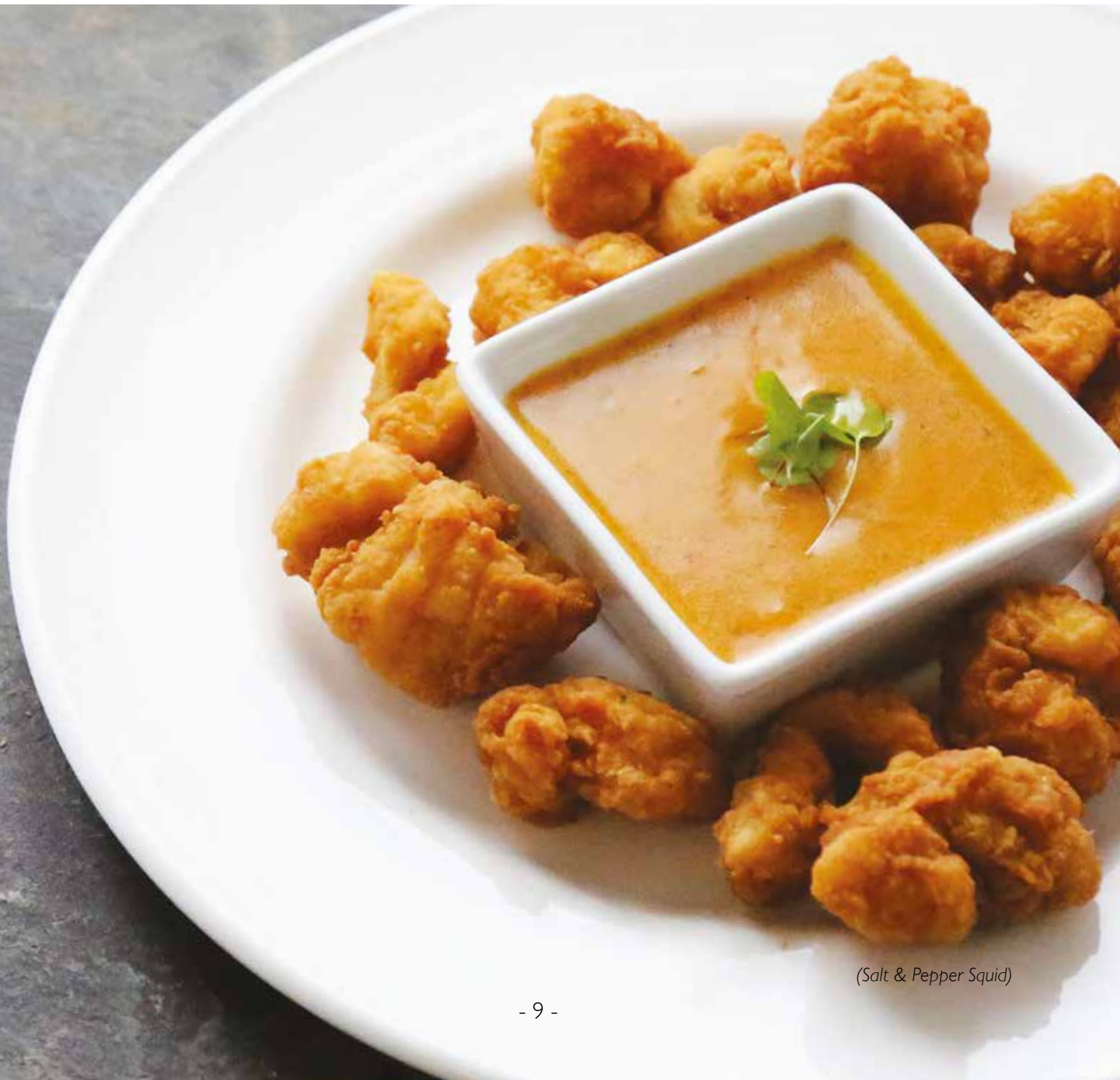
(Salt & Pepper Squid)