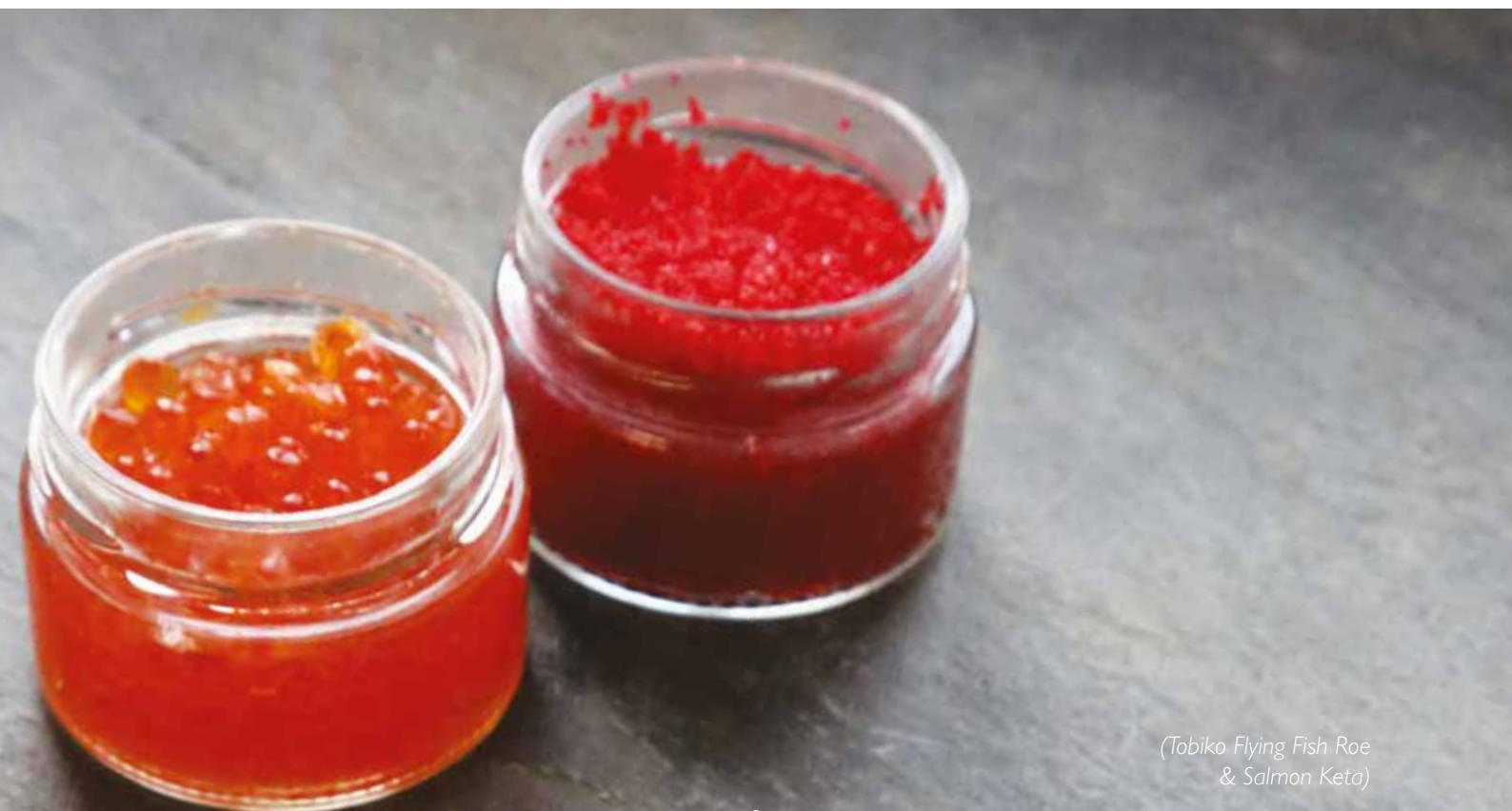
(Tobiko Flying Fish Roe & Salmon Keta)