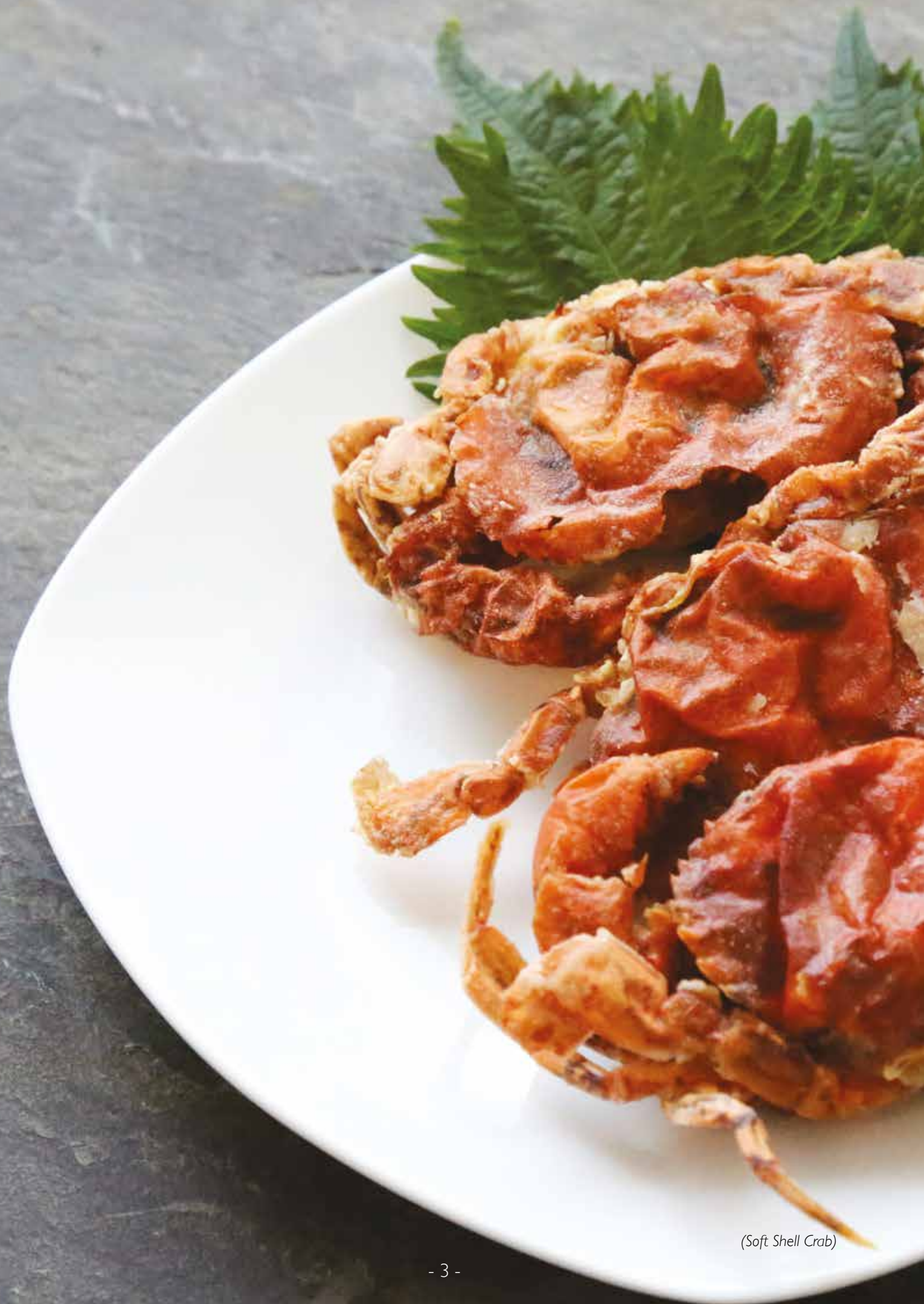
(Soft Shell Crab)