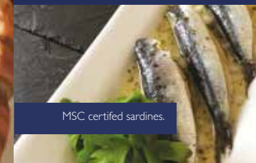
MSC certified sardines.