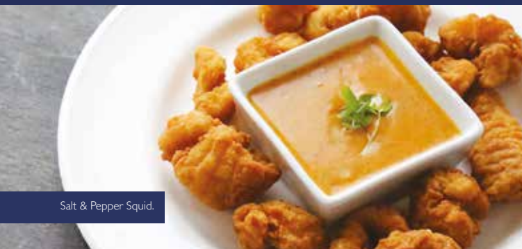
Salt & Pepper Squid.