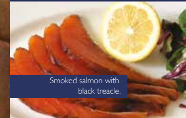
Smoked salmon with black treacle.