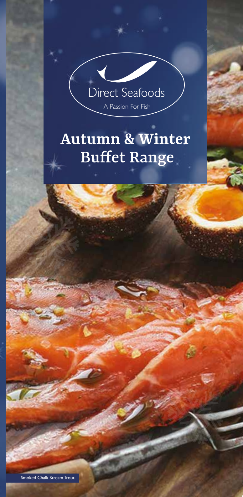
Smoked Chalk Stream Trout.