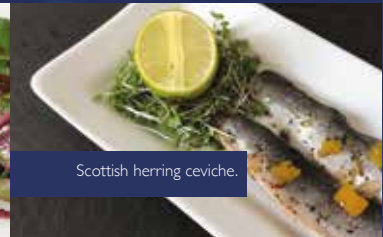
Scottish herring ceviche.