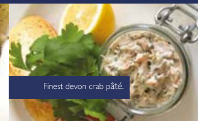
Finest devon crab pâté.