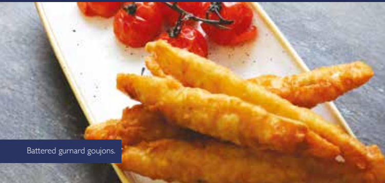
Battered gurnard goujons.